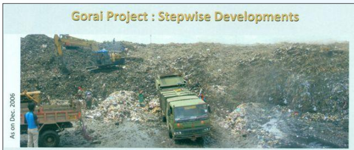
Gorai – Dec, 2006