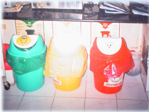
Colour Coded Bins